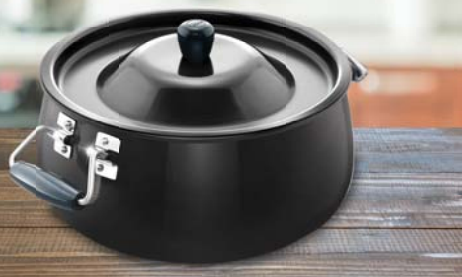
BIGBOY BIRYANI HANDI