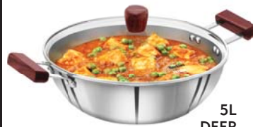
5L DEEP KADHAI