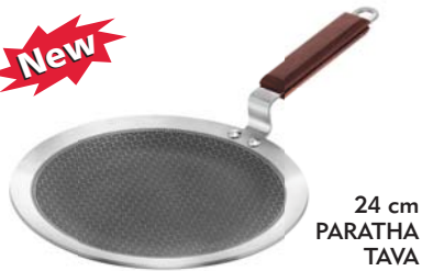
24 cm PARATHA TAVA