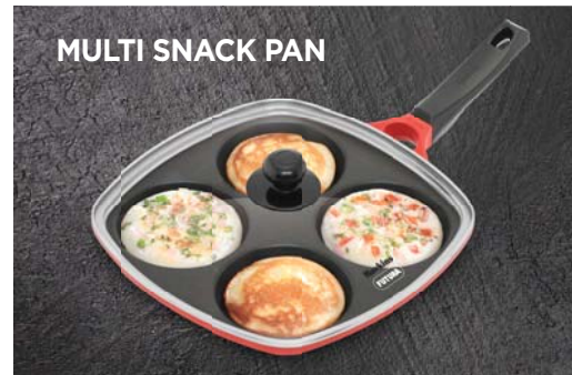
MULTI SNACK PAN