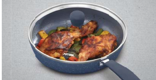
CERAMIC NONSTICK FRYING PAN