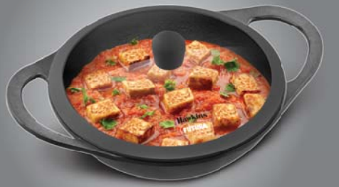
CAST IRON KADHAI